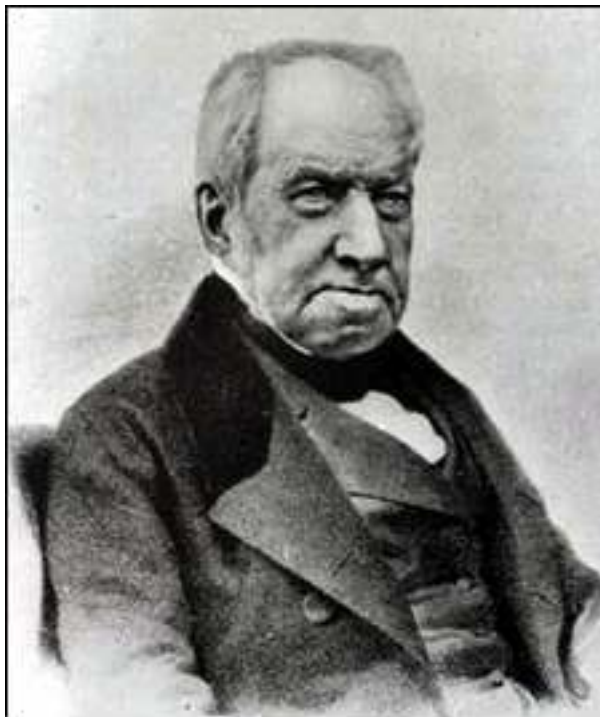
Jan Ingen Housz

Ingen Housz left London in 1775 for Italy, where he encouraged his friend Felice Fontana, Abbot to the Grand Duke of Tuscany, to improve upon the design of Priestley's eudiometer. Aged 46, Ingen Housz published his first scientific article, a review of eudiometry in 1776. Priestley, by this time, had published his discoveries of dephlogisticated air (oxygen), and several other gases. He explained how oxygen reacts, along with carbon dioxide, in animal and plant physiology, including reference to sunshine in plant growth.