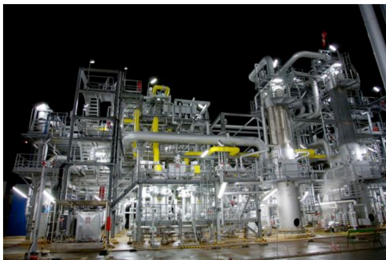
Figure 1: Claus plant of the Bayernoil refinery in Bavaria, Germany.

Most important among CFC’s patents is the one describing the production of elemental sulfur by oxidation of hydrogen sulfide with air at elevated temperatures in what has later been called a “Claus kiln” (furnace) using a metal oxide catalyst (German Patent nr. 28758, and British Patent 5958, both of 1883). Today this method (after considerable modifications [4]) is known as the “Claus process” [5]. It is applied worldwide on a large scale to process hydrogen sulfide from the desulfurization of crude oil by hydrogenation, especially in oil refineries. Figure 1 shows sections of a modern Claus plant at the refinery of Bayernoil in Bavaria.