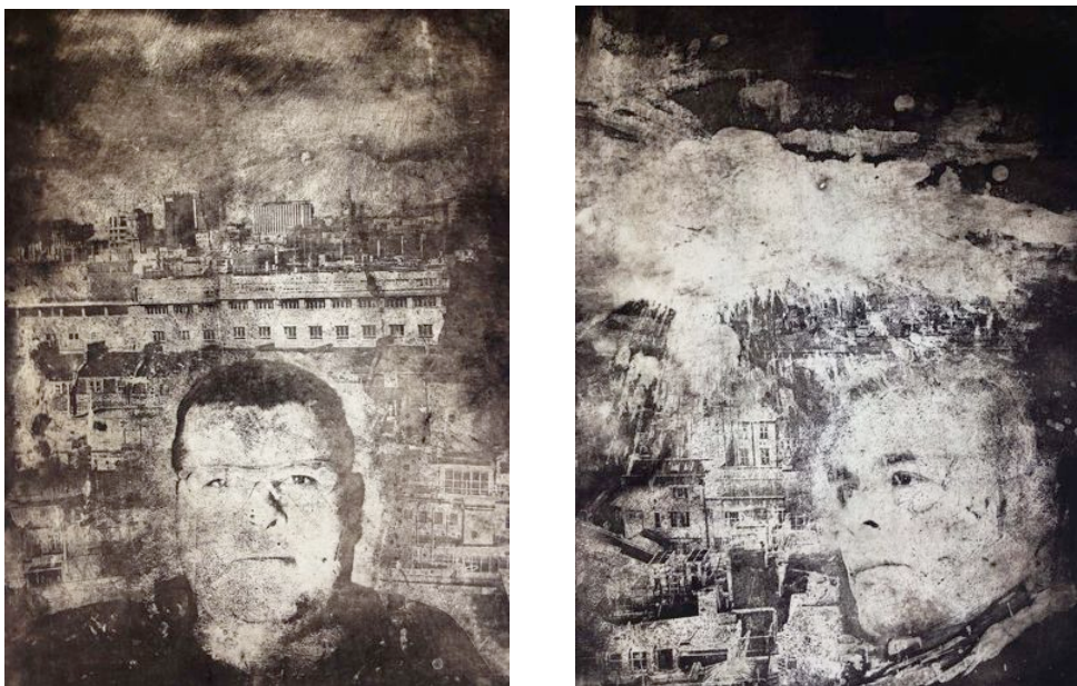
Figure 1: Portraits of demolition workers on the UCL campus acid etched into roofing zinc.