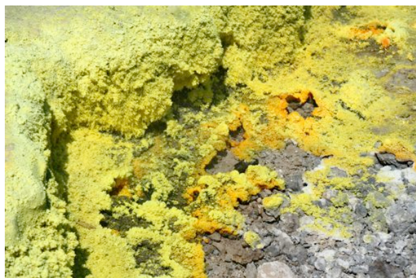
Figure 2: Sulfur deposits on the slopes of the volcano on Isola Vulcano (Italy)

In Figure 2 [10] a deposit of sulfur crystals on the island of Vulcano (Italy) is shown, formed by air-oxidation of hydrogen sulfide as a component of hot volcanic exhaust gases; the sulfur at this location is also known for its relatively high selenium content of up to 680 ppm [8]. In Figure 2 the gas vents can be recognized from the surrounding orange-red coloured sulfur which evidently is hotter than 25°C since sulfur is a thermochromic material.