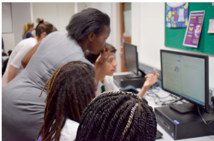
Figure 1: Students and their teacher crafting a Wikipedia article