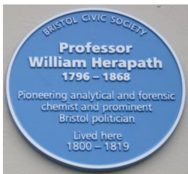
Fig. 1, The Herapath Plaque in Bristol