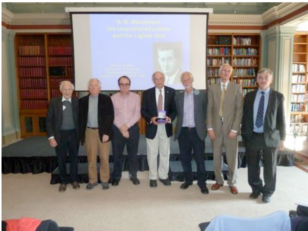
Speakers at the Woodward Meeting

Royal Society of Chemistry, Burlington House, London Wednesday 10 May 2017