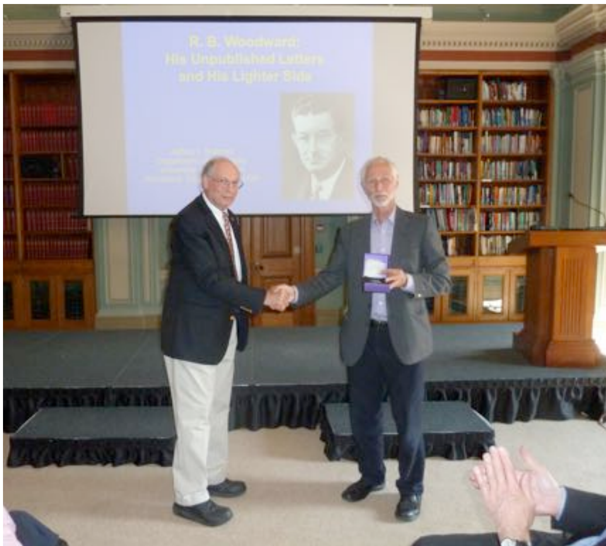
Presentation of the Wheeler Award

and high school students, and even individuals seeking medical advice (yes, Woodward published on many important naturally occurring pharmacologically active compounds). From letters that are ultra-serious to playful, a collection of excerpts was presented. These letters revealed the private side of Woodward and established that the grand style of writing exhibited in his scientific publications is found in his informal writings as well. Analysis of these letters provides a greater understanding of the workings within the chemistry profession in the 1940s to 1970s and these understandings were discussed in some detail.